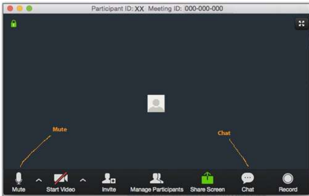
Zoom on PC or Mac showing Mute and Chat

If coming to the Virtual Coffee , please follow "Zoom etiquette" and take turns talking . One-on-one conversations are possible using the chat function and please mute if there is background noise around you.